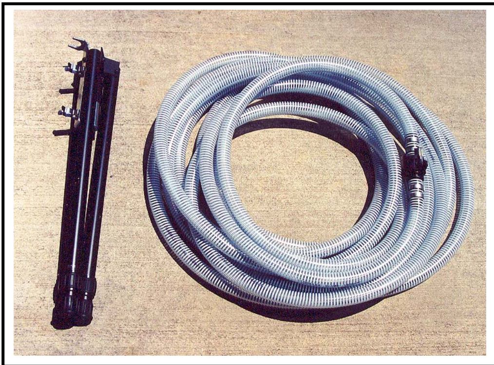
View of extension hose assembly rolled up and tripod in a folded collapsed position for storage / transport conditions. NOTE: Optional Storage Case is available. Contact Rhine Air for Details.